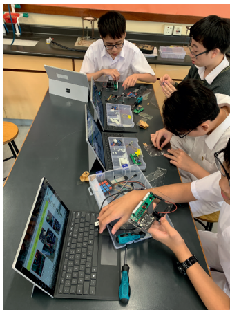
▲ Students assembling the Arduino mobile datalogger

Science is a discipline that shares a deep and extensive relationship with technology, and thereby, one cannot truly experience science without experiencing its technological dimension. It is my belief that a wise and purposeful use of technology not only can motivate students to learn, but also help students to understand science concepts and develop scientific literacy enthusiastically. Through innovative integration of technology within and outside the lesson, students can also understand our nature better and investigate like a scientist in a self-directed learning manner.