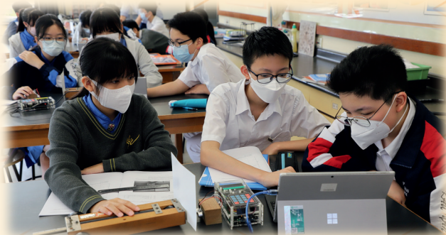
▲Students using mobile datalogger and sensor to measure the distance travelled and speed of a moving trolley.