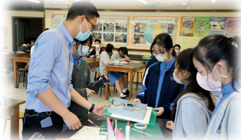
▲The awarded teacher guiding students to revise their STEM product.