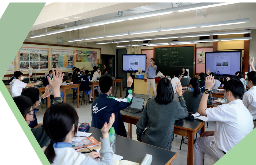
▲ Students actively responding to the teacher's inquiring in the lesson