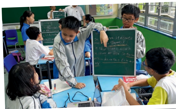
▲ Team work makes the dream work - Students are actively engaged in shared learning

A five-stage framework has been designed to engage every student in the learner-centred lesson to establish good learning habits and enhance his