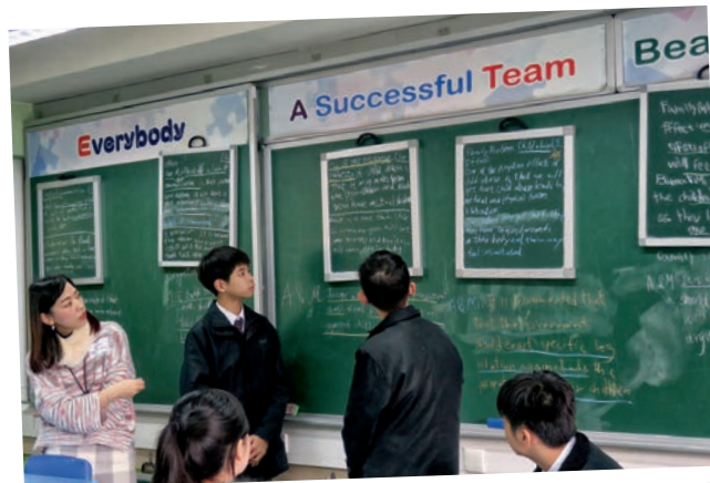
▲Engaging students in presentations and peer interaction

Based on the belief "Unlocking English = ENG age + estab LISH " as the key to effective learning and teaching of English, the group of passionate and highly proficient teachers empower students to establish themselves as the owner of their learning. They adopt "Learner-centred, Reading as the cornerstone, and Confidence building" ( LRC ) as the conceptual framework for a coherent English language curriculum integrating language skills, purposeful tasks and positive values and attitudes. They make the best use of what the school has done in self-regulated learning and put a great emphasis on cultivating students' good learning habits in preparation, sharing, reflecting and presenting, and building students' confidence in learning and using English. In the classroom, students are engaged in self-learning, peer learning and self-reflection to co-construct knowledge with teachers and peers and regulate their learning behaviour. Role taking by each member of the group of four guarantees nobody is left behind in the learning process. Collaborating with colleagues from other Key Learning Areas, the teachers help students establish links between concepts and learning experiences acquired in different subjects.