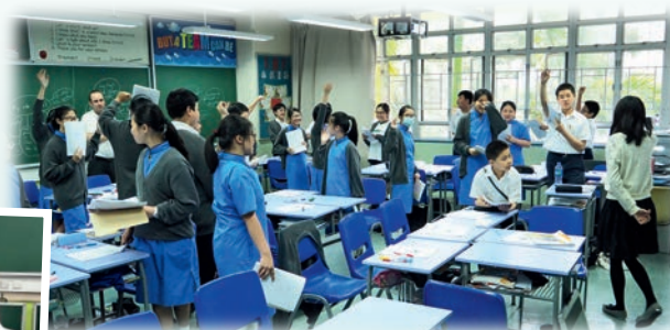
▲ Let me try! Students' confidence is built with this magical spell

Students' success is the best reward for teachers. By upholding "Every child is able to succeed", every English teacher in the College is learning and growing with the students confidently.