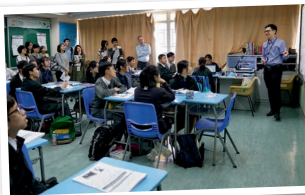
▲ Building learning communities - Sharing with local and overseas educators