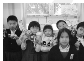
Designing a clothes shop