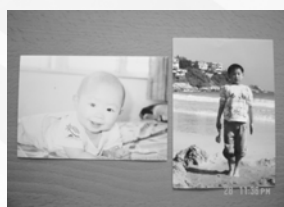
Practising past tense with the help of 2 photos of himself --- oral presentation