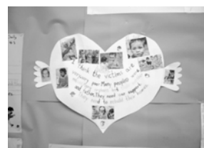
Pupils' writing on current hot issue --- Tsunami Disaster