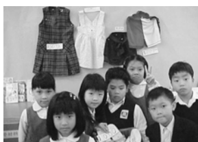
Designing a toy shop