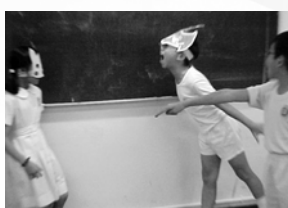
Acting out their own story