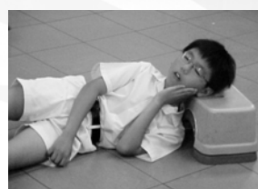
Acting out their own story