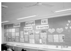
Creating an English learning environment