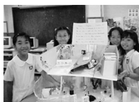
Model making---presentation and debate