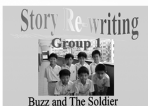
Story re-writing--- group project