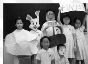
Acting out their own story