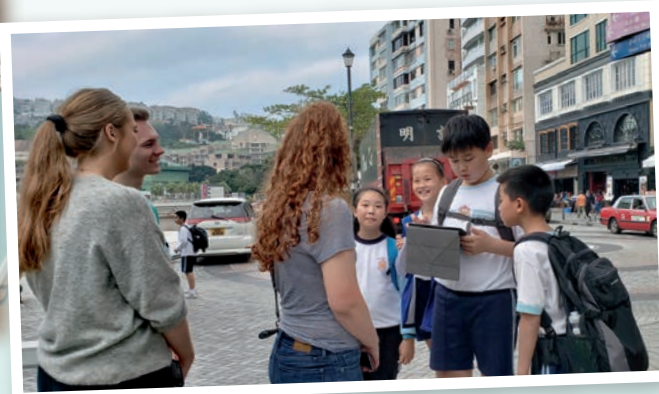
▲Students are having authentic experiences in interviewing overseas visitors