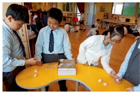
▲ Students are enjoying playing an old school game, the "Hong Kong Jacks"

Writing does not occur in a vacuum. Our writing curriculum is embedded in the e-curriculum to provide prerequisite reading and language input. To make learning English fun and enjoyable to students, we introduce interesting games and activities into our lessons. Each lesson from P1 to P6 is made up of carefully and thoughtfully designed tasks to strengthen students' language skills through cyclical learning with fun and laughter. These games and fun activities bring rich and meaningful contexts into the e-curriculum. In one learning unit last year, students were easily motivated by comparing old games and virtual reality games developed by students. They had the opportunity to try playing the games in game booths erected in the school hall. They introduced to interested players the rules and regulations of the gaming activities in English. Students reflected that they learnt English in "real-life experience". Games and fun activities add spices to lessons. These activities,