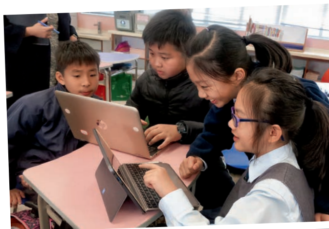
▲Students enjoy doing team work in e-learning tasks

A wide range of interactive learning and teaching activities are designed to build up students' confidence and develop their writing competence. The teachers generate recurring mind maps and authentic writing topics like "Me" to help students compose their own writing frames. The use of cyclic writing frames helps students with diverse abilities to retrieve, recycle and reinforce their prior language knowledge and skills to become more self-assured writers. Senior students are allowed autonomy to choose the topics or the intended audience for their writing tasks. They are entrusted with the responsibility of self-directed learning and play an active role in the diverse student-centred activities. E-learning resources, e-tools and fun games are used to develop students' capacity in independent learning. Tasks or competitions, such as the P6 inter-class competitions on service learning, are designed to inspire students from diverse backgrounds and abilities to choose their roles in the tasks according to their abilities. The extra-curricular programme, like the "Shakespeare's lessons", is designed to expose the gifted students to Shakespeare's masterpieces and to arouse their interests in writing creatively. The teachers succeed in creating a language rich environment for their students to read extensively and use language meaningfully inside and outside the classroom. Students are provided with ample