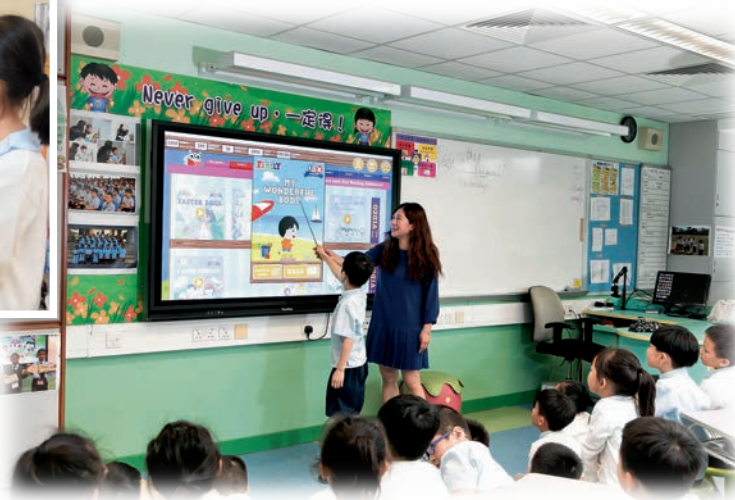
► A student is given the chance to become a "little teacher"