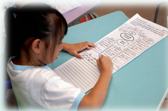
▲A young student learns to create a writing frame for "Me and the park"

The cycle of learning does not stop there. Students are required to write individually about their favourite teachers in P6. They are given the autonomy to choose