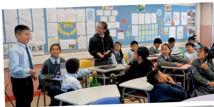
▲Peer assessment is a key element in the writing process

Our objective is to promote students' intrinsic motivation in learning English through developing their writing competence. We aim at shaping them into independent and confident writers capable of reaching their full potential. We continue to develop students' writing competence through cyclic learning in a safe learning environment. Through using mind maps and authentic, student-centred writing topics, students are trained to compose their own writing frames for some real-life topics like "Me". "Me" is explicitly recycled and linked to the new