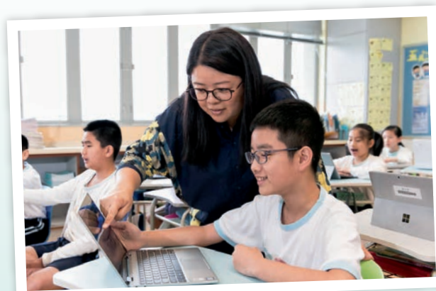
▲ Attending to students one by one during reading practice