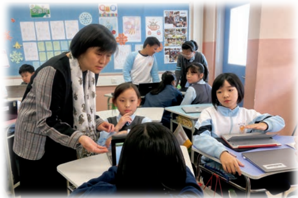
▲ Coaching students to address learner diversity in group work

together with other appealing activities like drama, musicals, animation films appreciation, Fung Kai's Got Talent, etc., enhance students' motivation in the learning process. Knowledge and skills acquired in the General English lessons are applied and consolidated in their writing. We provide opportunities for students to share their work orally in the class or on the e-learning platform. They appreciate and critique others' writing and oral presentations. The sharing facilitates peer assessment and cooperative learning.