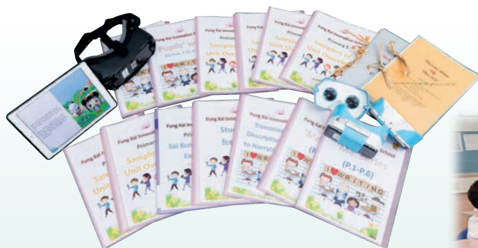
▲ Teachers design the 'Me' series for the writing curriculum

To some, changes might be daunting but the school has been well known for shaking things up. The school first introduced e-learning ever since its establishment, and three years ago, the team decided to try something different. They introduced the Self-Determination Theory into their English curriculum. "We want students to become lifelong learners. We want them to be learning by themselves not because they have to, but they want to,"