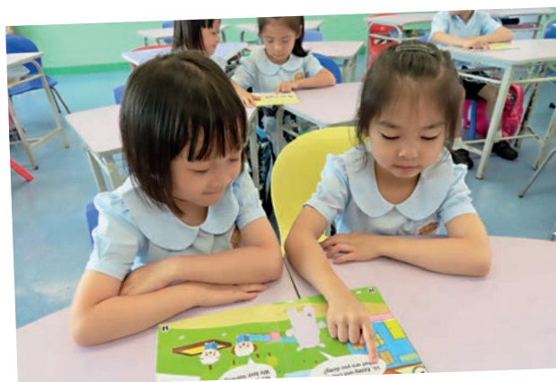
▲ Students do pair reading enthusiastically during class